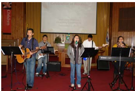
Youth Band during worship

“As we rethink church, what is the role of lay leadership?”