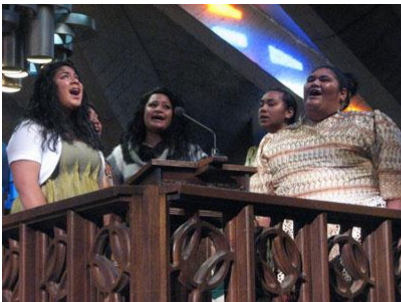
The voices of the new Youth Band of the First Tongan UMC of Palo Alto